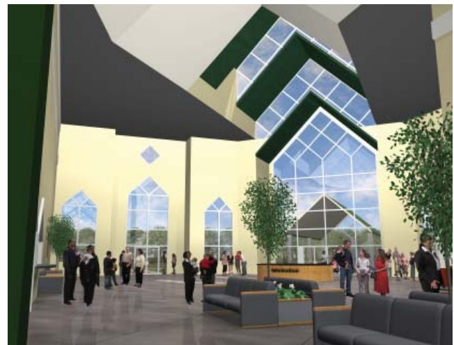
Evergreen Baptist Church